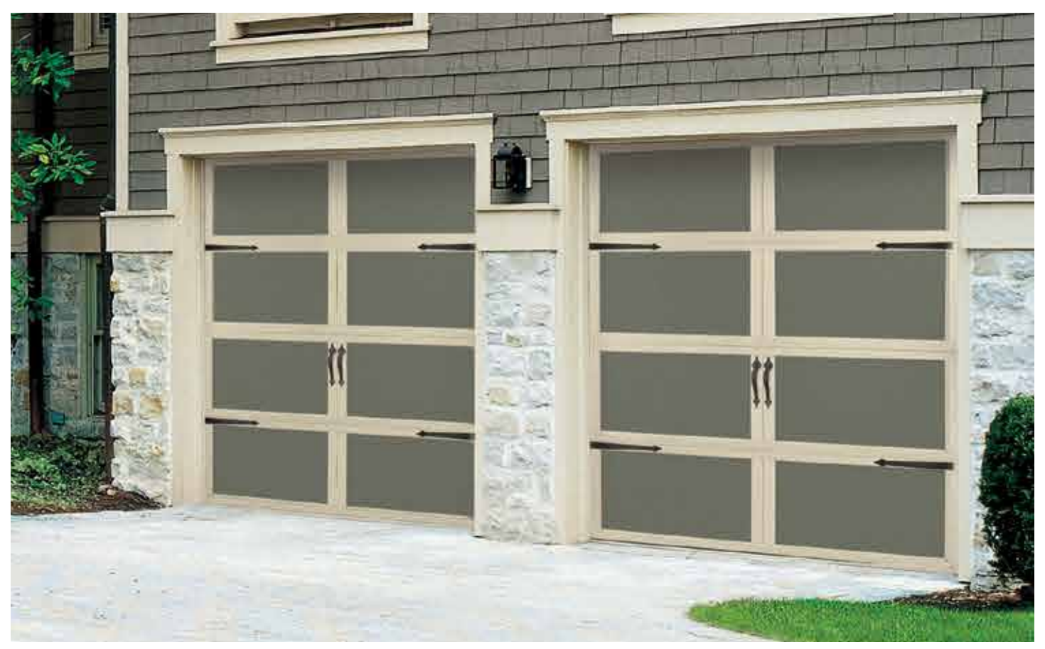
Model 9400 shown in Westfield design with optional decorative hardware